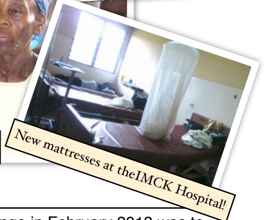
New mattresses at the IMCK Hospital!

The purpose of my travel to the Democratic Republic of Congo in February 2013 was to collaborate with staff of Institut Medical Chretien du Kasai (IMCK) on behalf of Friends of IMCK (FIMCK) and Medical Benevolence Foundation (MBF) and to make reports back to IMCK, MBF, IMCK, Presbyterian Church USA, Rivers Of the World (ROW) and my church, First Presbyterian Church of Hilton Head, SC (FPCHH). The focus of the trip concerned IMCK publicity and developmental goals. The trip also included a meeting with members of IMCK and Communauté Presbyterienne au Congo (CPC) regarding the current construction of the IMCK Founders Chapel. I also met with CPC staff and American mission coworkers regarding some of their projects at Tshikaji and in Kananga. Since I edit a monthly newsletter about IMCK, I arranged interviews and took photos and videos during the week.