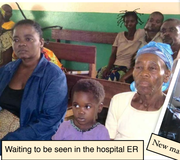
Waiting to be seen in the hospital ER