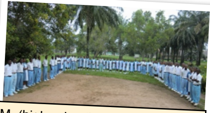
ITM (high school) students of IMCK