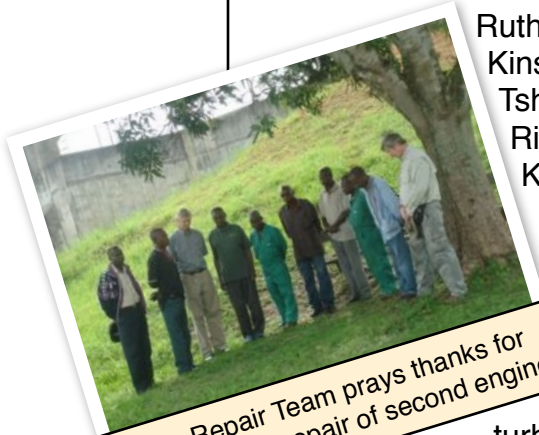
Hydro Repair Team prays thanks for completion of repair of second engine.