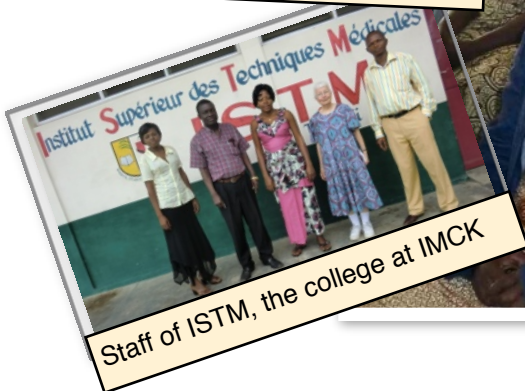
Staff of ISTM, the college at IMCK