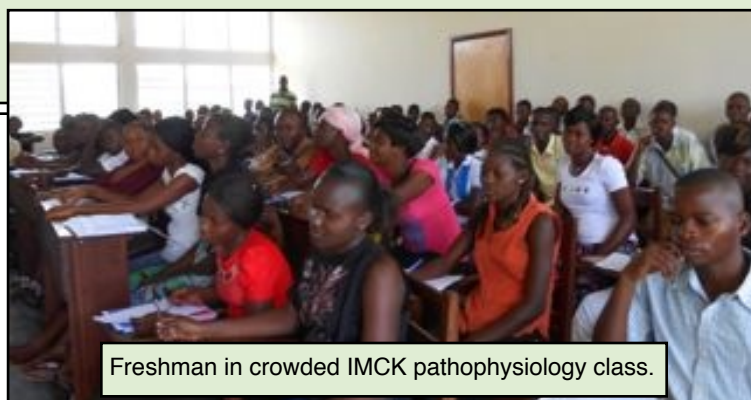
Freshman in crowded IMCK pathophysiology class.