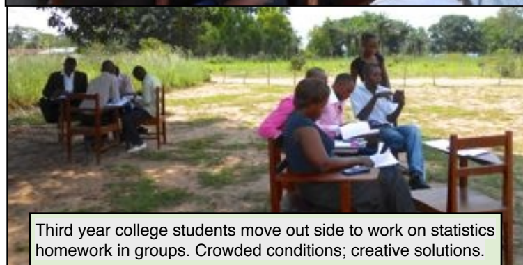
Third year college students move out side to work on statistics homework in groups. Crowded conditions; creative solutions.