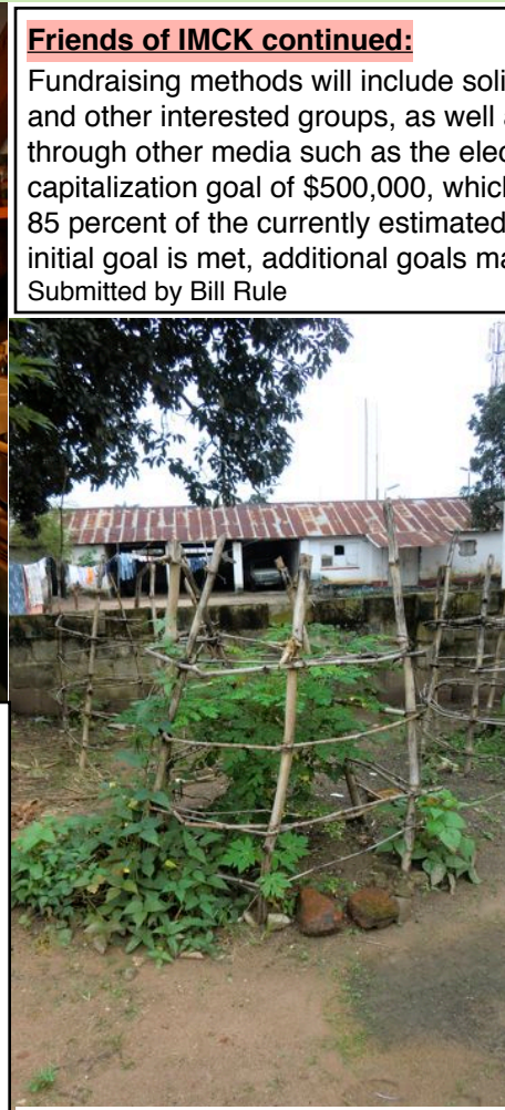
Moringa Tree that has been growing for about one year from a little sprig.