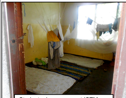
Students dorm rooms at ISTM.