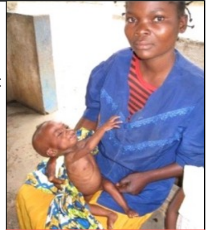
Infant brought to the nutrition center at IMCK