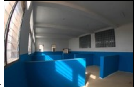
Women's Center with fresh paint!

end of June, Antonio reports. But he reports that during the greatest period of conflict, the construction workers at PAX were robbed of all they had. On