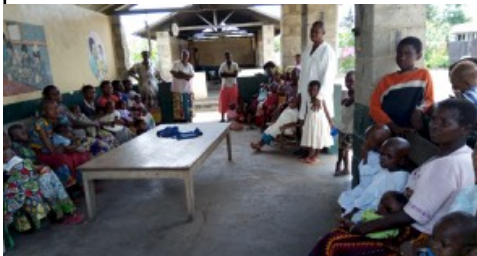
The nutrition center at IMCK

Helping Programs: These are reports of work of other groups: IMCK, Project: Hope-Congo, Medical Benevolence Foundation (MBF), Presbyterian Disaster Assistance (PDA), and InterChurch Medical Assistance (IMA.)