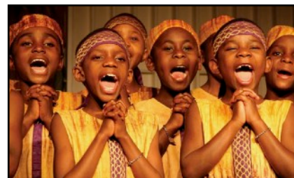
Congolese Children Singing Click here for a short video of more singing and dancing