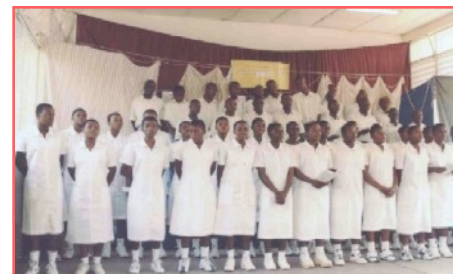
Nursing students singing at church

I also write this message especially to show my affection and my understanding not only to all those who have been victims of the events that caused the insecurity in the Kasai Central region and whose suffering from violent and non-violent trauma remains palpable, genuine and visible (Acts 7:26); but also to my colleagues and employees who showed their dedication and competence during this year 2017, which was not easy, but did not prevent them from contributing to the fulfillment of the triple mission of the IMCK (those of Evangelization, Training and Healing).