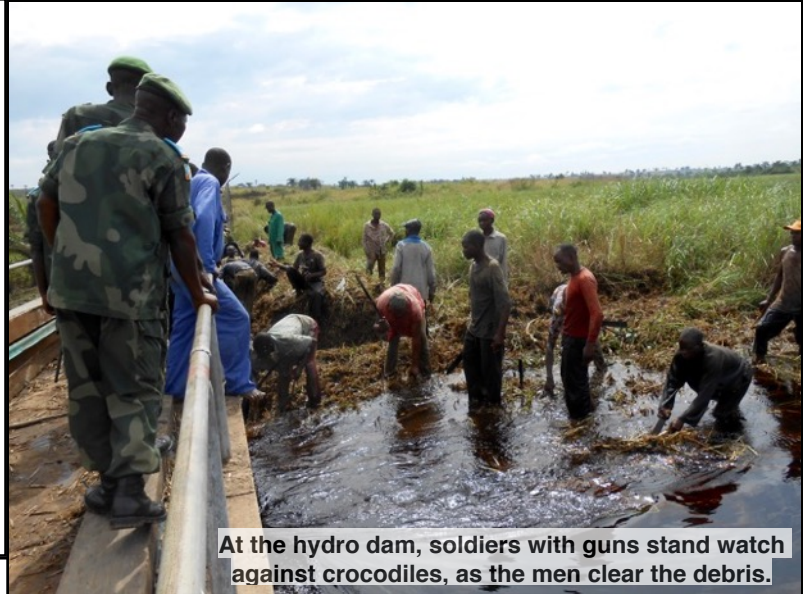
At the hydro dam, soldiers with guns stand watch against crocodiles, as the men clear the debris.