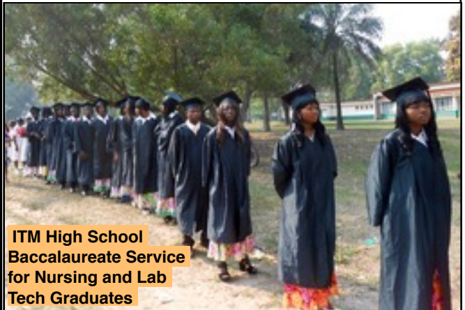
ITM High School Baccalaureate Service for Nursing and Lab Tech Graduates