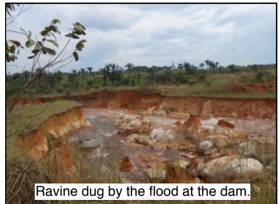
Ravine dug by the flood at the dam.

Dale Stanton-Hoyle, an engineer who helped with the hydro construction, is helping to develop this plan. Given that IMCK has not yet finalized the precise plan, it is too early to provide a specific cost estimate for repair work. It will however require a significant expenditure, likely in the range of $100K to $150K. (Ed Note: See Board minutes re: same issue.) It may also require a prolonged period during which the hydro will not be functional. There is some urgency to do some work in the next two months before the rainy season returns. To learn more about how to help support this project, contact Medical Benevolence Foundation at (800) 547-7627.